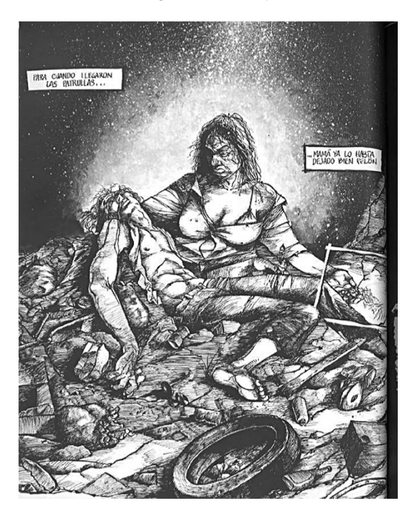
Figure 5. The Pity