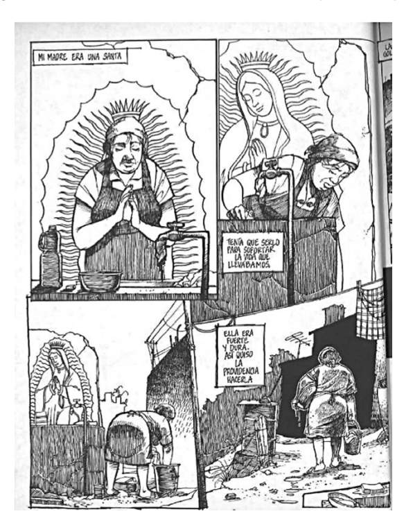
Figure 1. Urban environment in which the story is developed